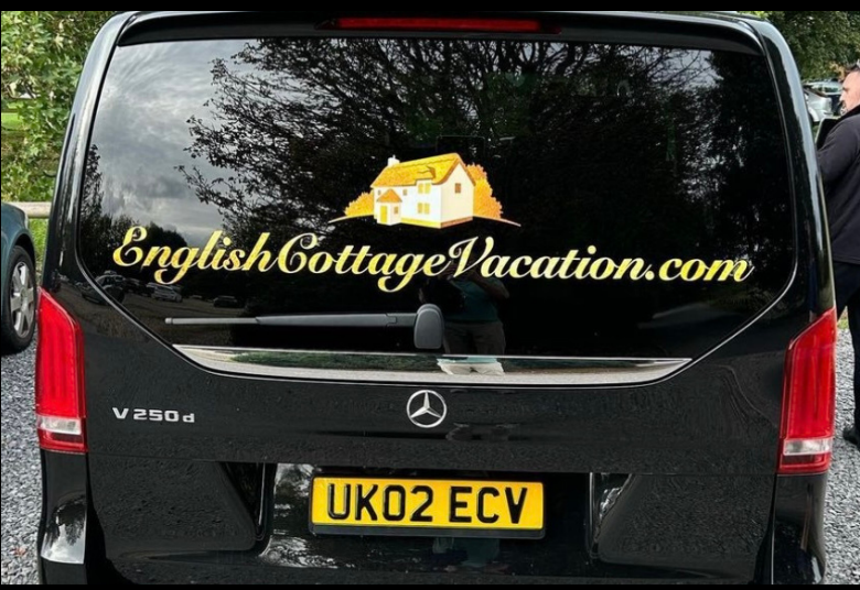
Day 8 - Departure Day

It's time to start reminiscing on the good times spent at Well Cottage. We will ensure you're well fed before Nathan delivers you to, either your chosen airport (or your preferred location*) before saying our heartfelt goodbyes.